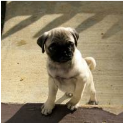
Meet Mighty Gus, the Lindeman-Shackleford household